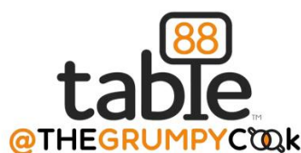
Table88 CIC t/a The Grumpy Cook

Get in contact by emailing edward@thesussexpeasant.co.uk